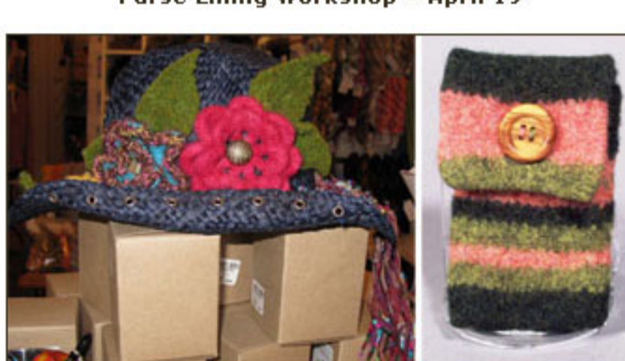
Knitted Flower Embellishments & Felted Cell Phone Case